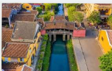
Japanese Covered Bridge