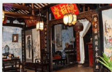
Tran Family Chapter