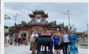
Phuoc Kien Assambly Hall